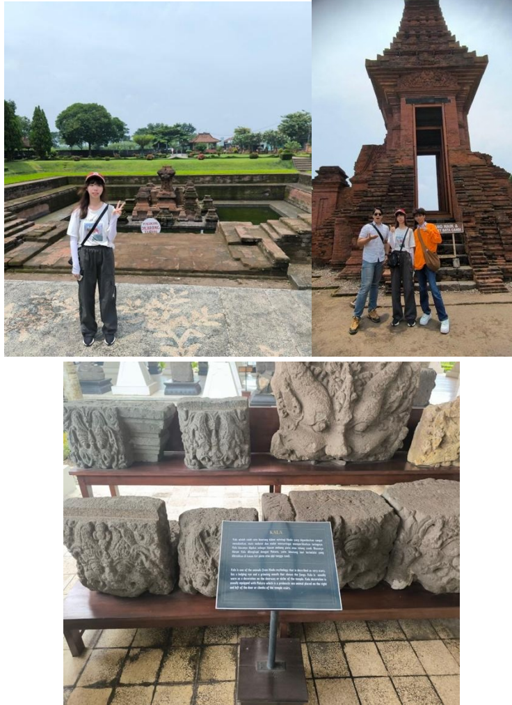
Candi Tikus, Mojokerto