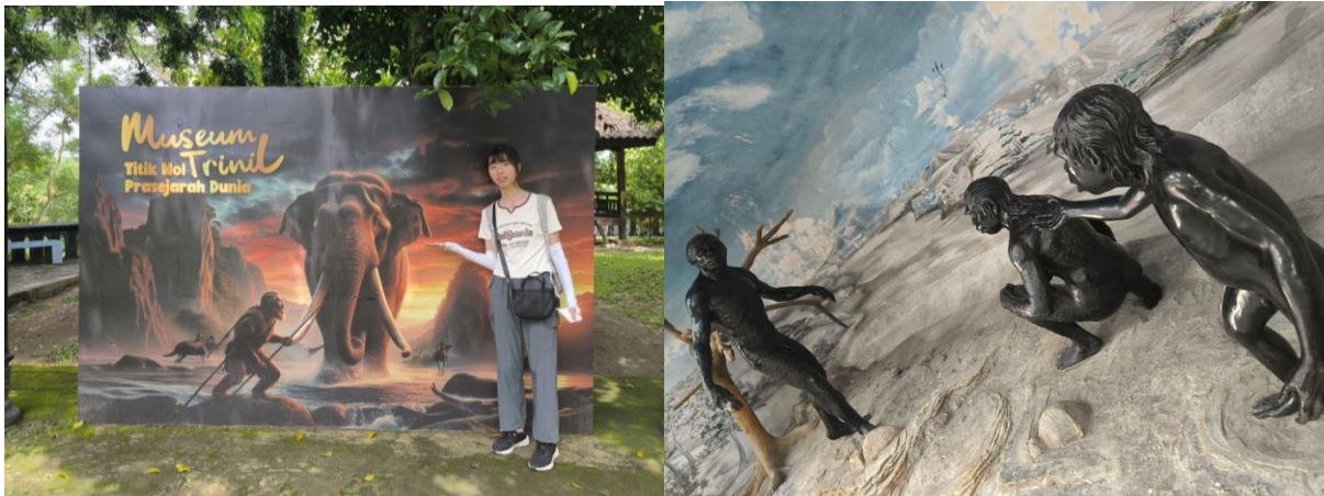
Museum Trinil Ngawi, Trinil

On the last day, we went to Trinil, where the first Homo Erectus fossils found. Although it takes us 4 hours to arrive the westernmost part of eastern Java, the historical background in there and the well-preserved prehistoric animals' bones are remarkable.